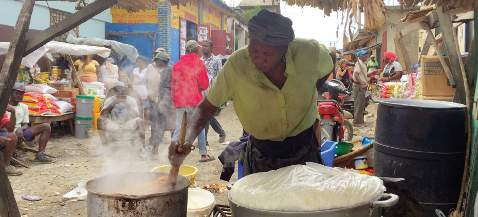
The main market in downtown Gros Morne, Haiti