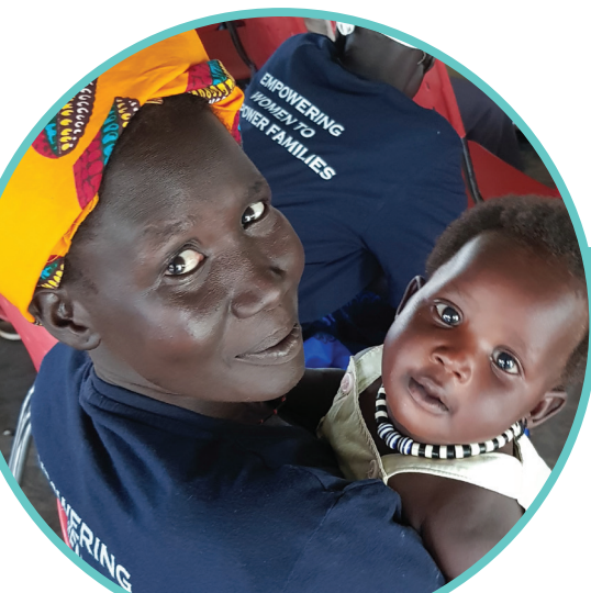
Left: A refugee mom in MBB's Micro-Enterprise program with her daughter.