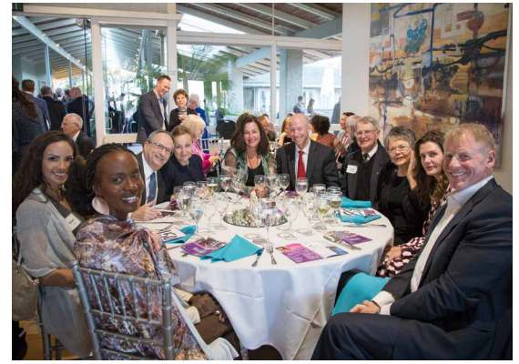
MBB hosted an energetic throng at the Quadrus Center in Menlo Park for its April 2019 Annual Gala.